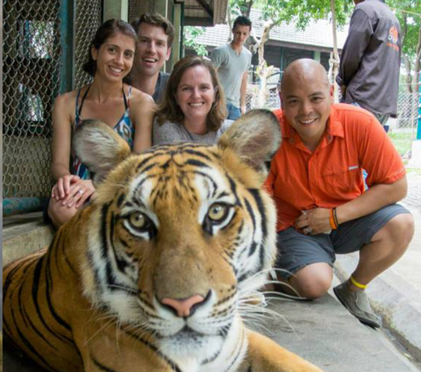
Top left: Cusco, Peru; Top Right: Taj Mahal; Bottom Left: Iceland; Bottom Right: Thailand