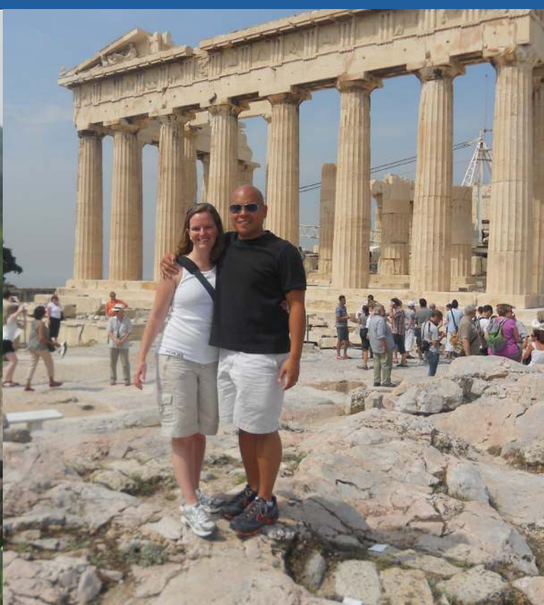
Left: The Great Wall of China; Right: Acropolis, Athens, Greece